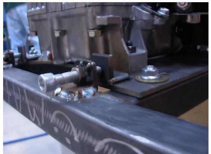
Chain tension system