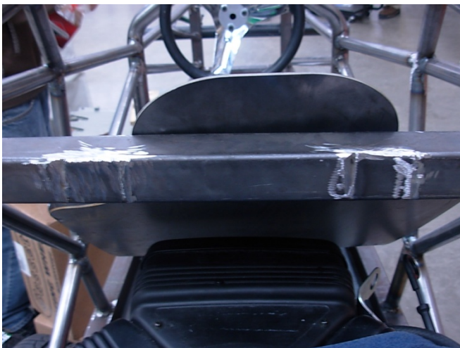
Removed gas tank mount